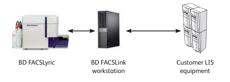
Figure 1. BD FACSLink LIS interface solution

Helps to improve laboratory productivity and data quality by eliminating manual data entry and reducing transcriptional errors.